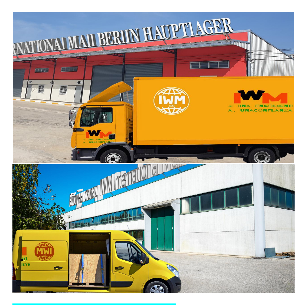
What is Premium agent cooperative warehouse?